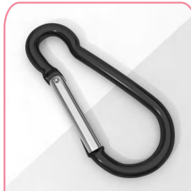
METAL CARABINER Color: grey W: 2.3cm, L: 4.7cm