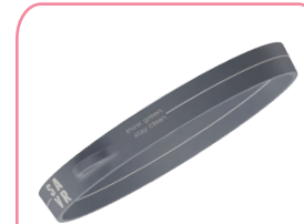
SILICON BAND Color: grey L: 150mm folded